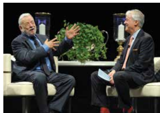
Stephen Sondheim pictured with NPR's Scott Simon