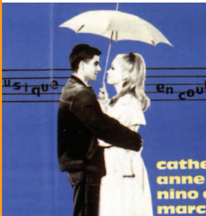
THE UMBRELLAS OF CHERBOURG