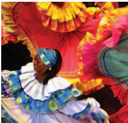
THE MEXICAN FOLKLORIC DANCE COMPANY OF CHICAGO