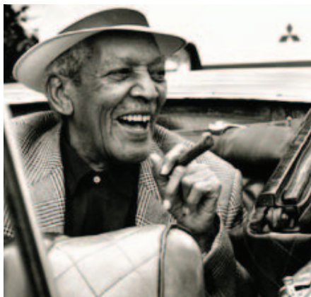
BUENA VISTA SOCIAL CLUB