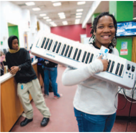
YOU MEDIA AT CHICAGO PUBLIC LIBRARY

After silence, that which comes nearest to expressing the inexpressible is music.