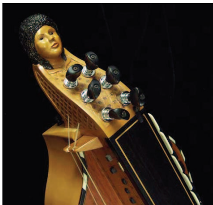
HURDY GURDY FROM ANDY'S MUSIC CHICAGO