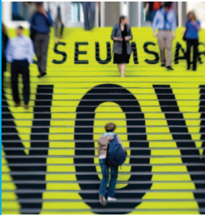
MUSEUM OF CONTEMPORARY ART