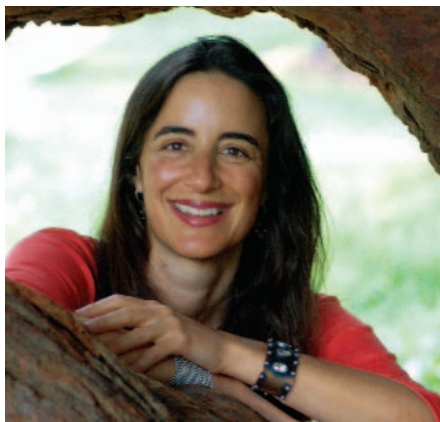
JANDY NELSON AUTHOR OF THE SKY IS EVERYWHERE