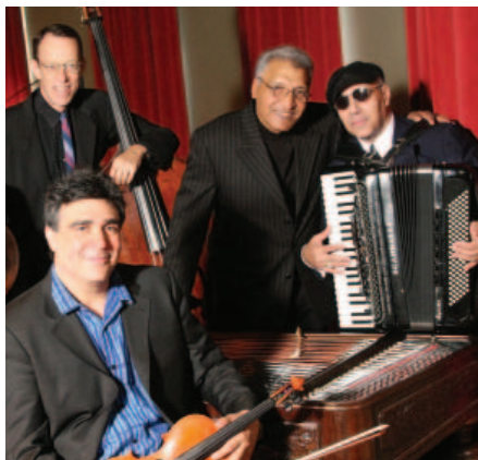
GYPSY RHYTHM PROJECT