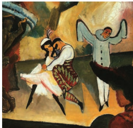
BALLETTS RUSSES BY AUGUST MACKE